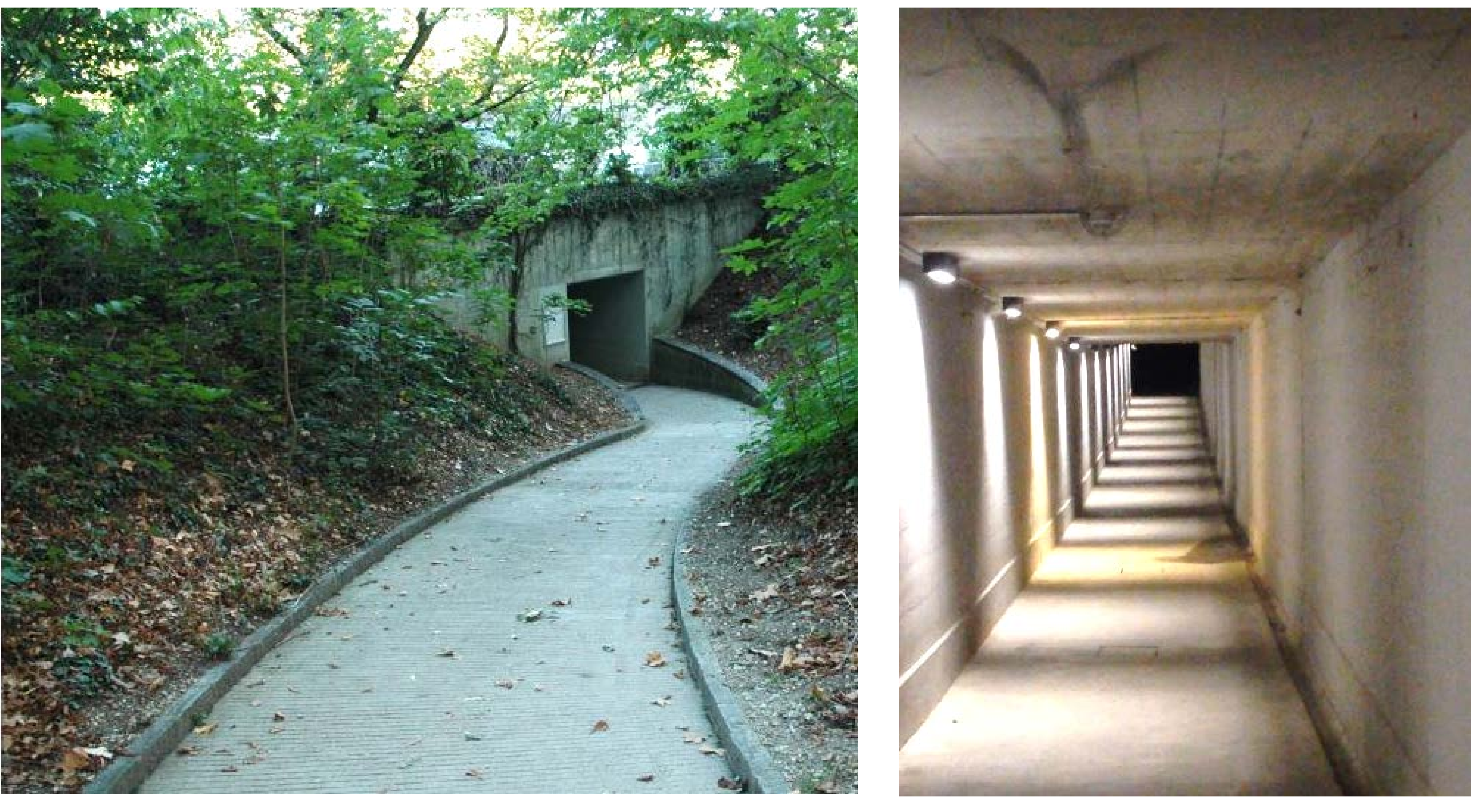
Figure 1 : Location of the underpass

Up to 1200 crossings have been monitored in a single night, and we also observed hunting behaviors within the underpass. However, as soon as the lights go on, bats will leave the underpass and do not cross anymore, which is not astonishing for lucifugeous species like Daubenton's bats.