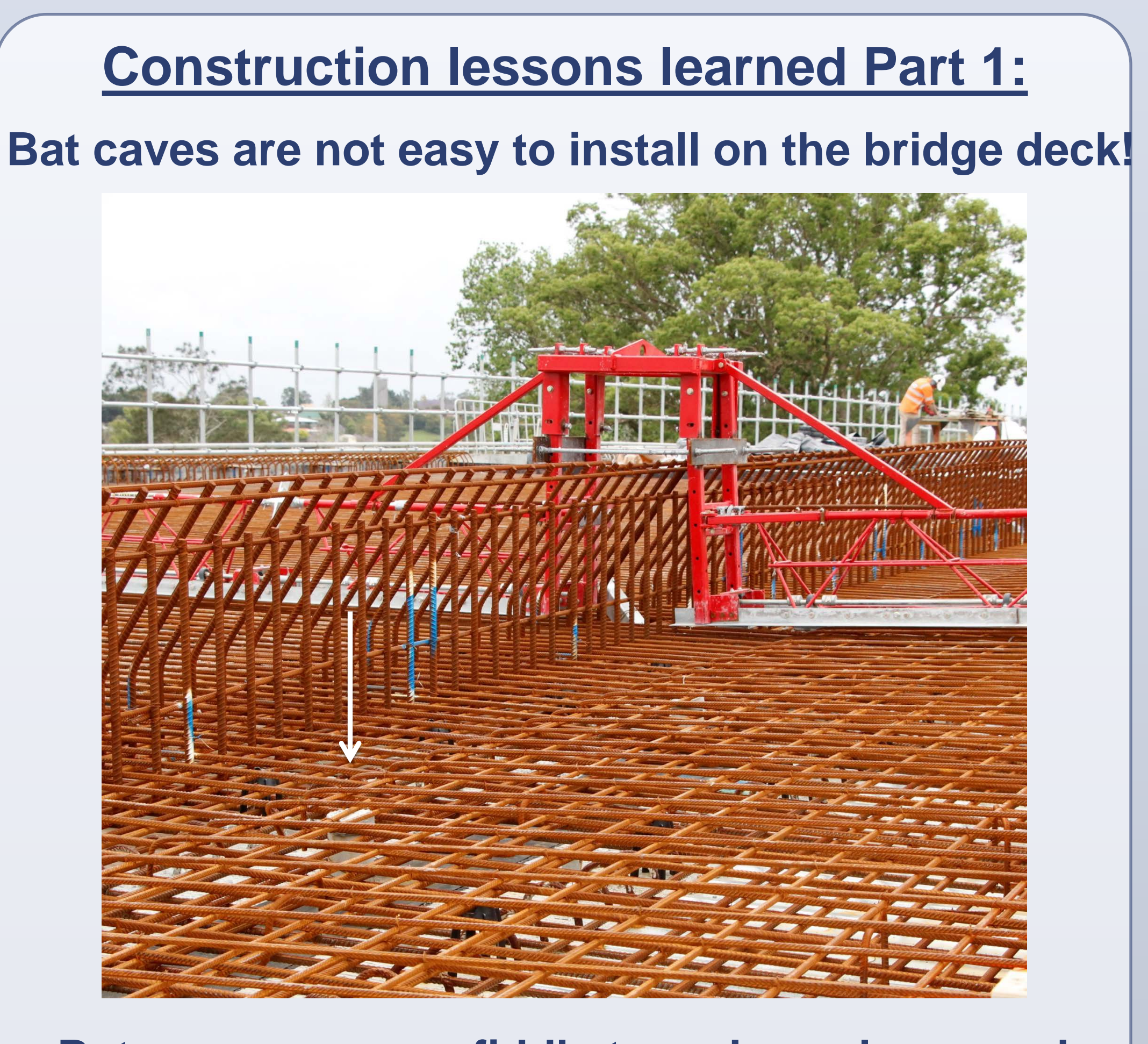
Bat caves are very fiddly to make so leave grab holes open!