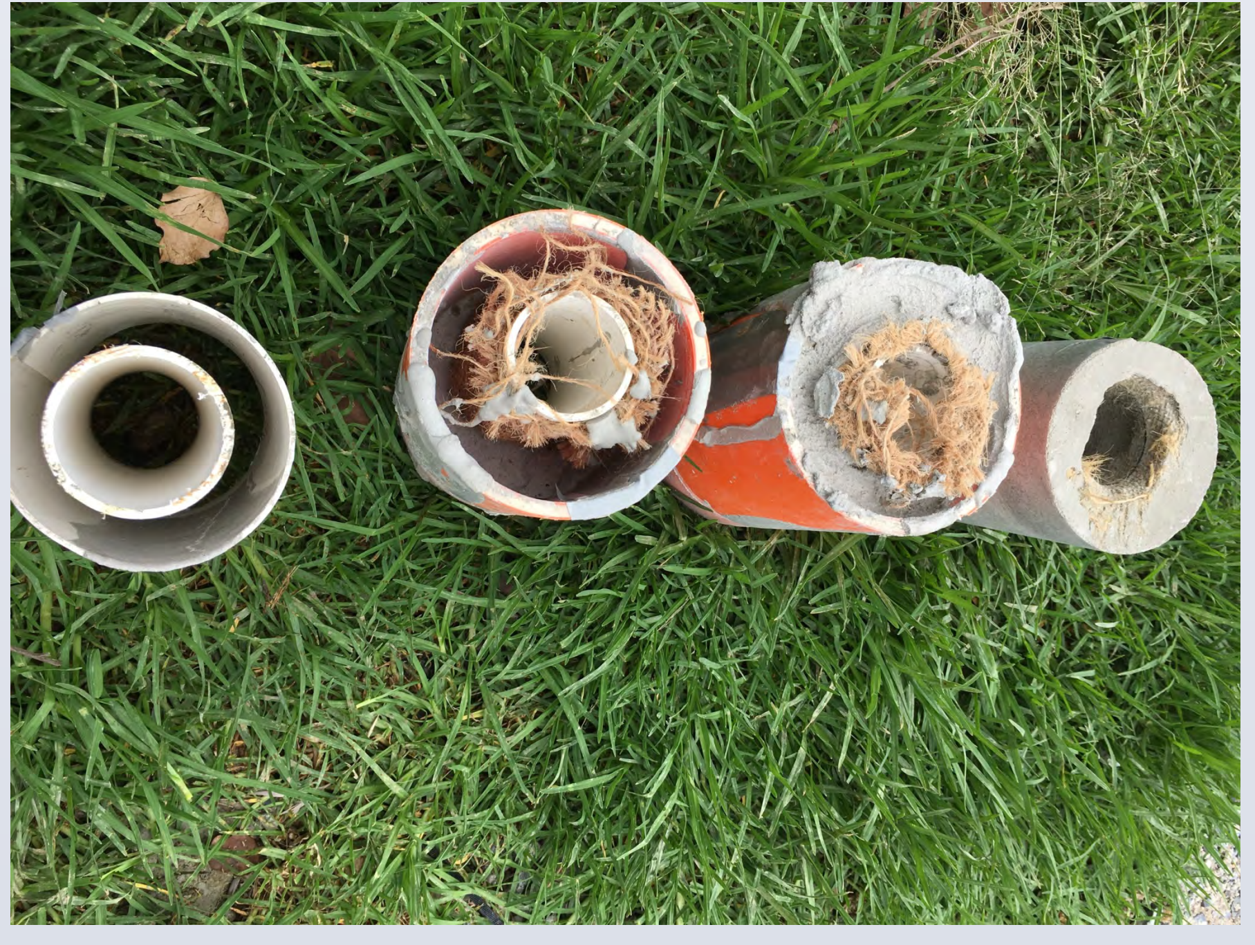
But they look pretty awesome!